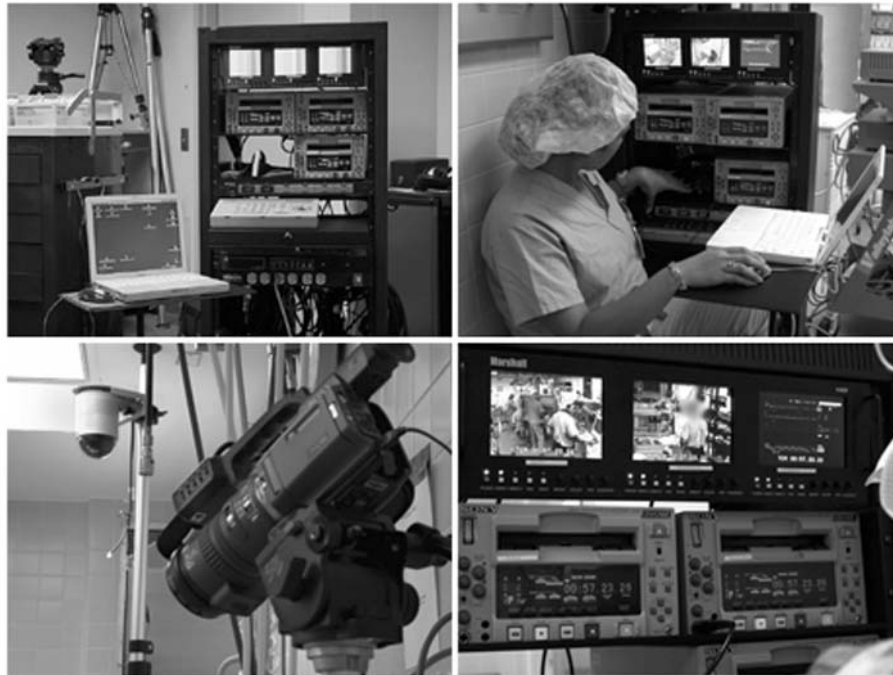
Figure 1 Clinical data collection system. Four views of our current data collection cart and associated video cameras. The data collection system includes three digital videotape recorders, two cameras, wireless and wired audio recording, time code synchronization, and a laptop computer running custom software for behavioral task analysis and clinical workload assessment.

The audio system is designed as a series of four concentric zones, with the outermost zone being the least directional and the innermost being the most focused. A total of four