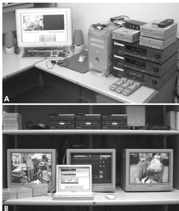
Figure 3 Digital video processing, archiving, and viewing stations. (A) DVD creation station (right) where three digital videotapes containing raw clinical video footage are burned directly to MPEG-2 encoded video on DVD. To the left is the non-linear digital video editing station, an Apple Macintosh dual processor G4 computer running commercially available software. (B) DVD review station. A computer running custom software controls three industrial grade DVD players attached to high quality color monitors. The review software permits synchronized playback of any case segment and annotative text entry (with associated case time) linked to our clinical event database.

video—unfortunately, digital audio has never been quite as precise. Because digital audio is not defined as having a frame rate (instead using a much higher frequency sample rate), different manufacturers have devised different methods for maintaining audio and video synchrony. These methods are not always perfect over long periods and can also filter during format transfers (such as from DV to DVD). In practice, we have observed an audio drift of 2–4 frames after 2 hours of “synchronized” DVD playback. While noticeable as a slight echo during regular playback, audio drift can easily be corrected during processing and, in cases as minor as this, can be corrected with our playback software.