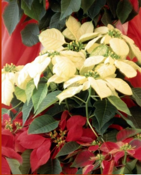
Are Poinsettia Plants Poisonous?

“Did you know that poisonings often happen when routines are disrupted?”